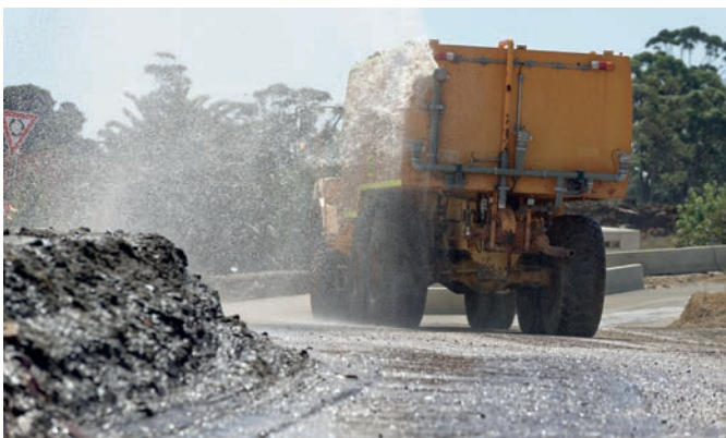
Street sweepers and water carts operate daily at our sites.