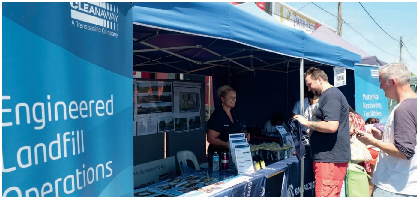
Cleanaway is a major sponsor of the Clayton Community Festival held annually in February.

Cleanaway is a major sponsor of the Kingston City Football Club and Clayton Community Festival.