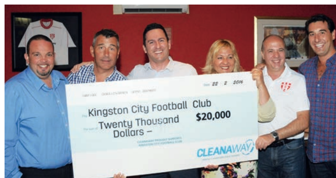
Cleanaway is a major sponsor of the Kingston City Football Club.