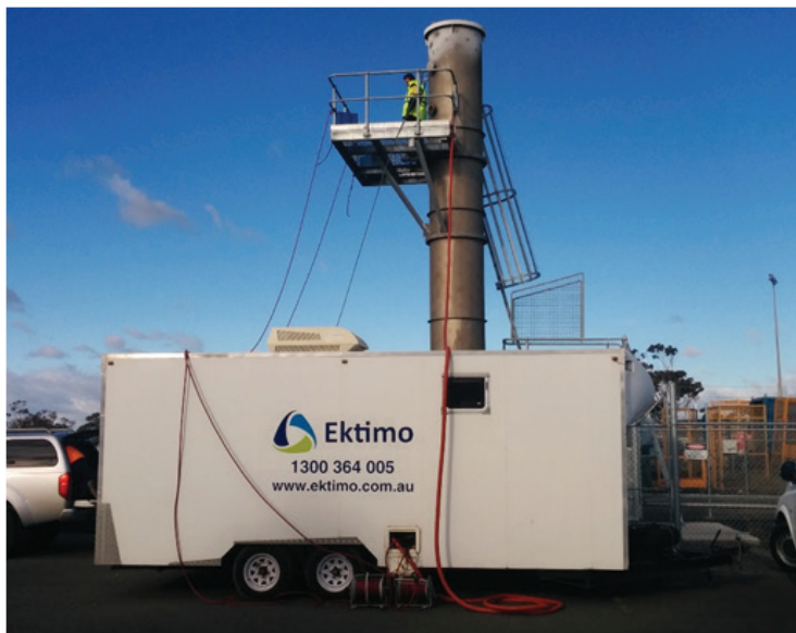
Setting up for flare testing

The air quality testing that was undertaken in April and June at the flare showed 99.995 % efficiency for methane destruction which is the upper detection limit for the instrument that was used. A second full emissions test is to be completed during July when climate conditions are coldest. A new air testing procedure, capable of testing a full suite of chemicals including Vinyl Organic Chlorides, is being developed. It is expected results will be available end September.